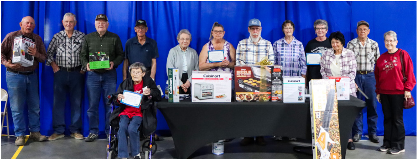
Door prize winners celebrate with their winnings.