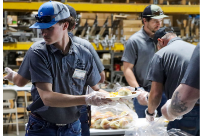
Linemen step in to serve, plating meals for attendees.