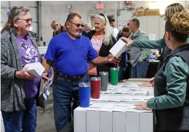
Members receive annual meeting gifts, including branded cups and hats.