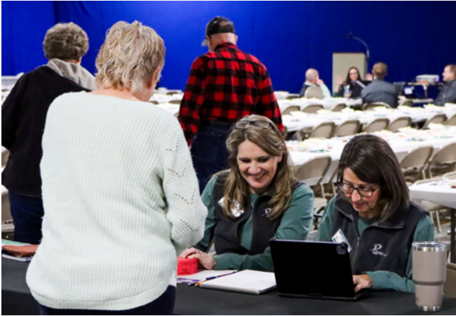
Staff check in members and hand them tickets for the door prize drawing.