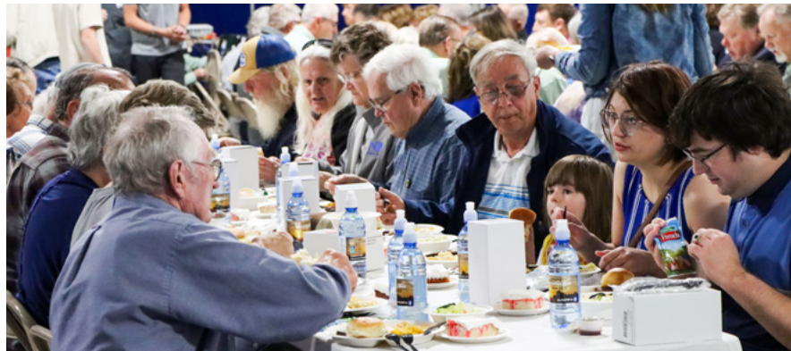
Members connect and catch up before the meeting begins.